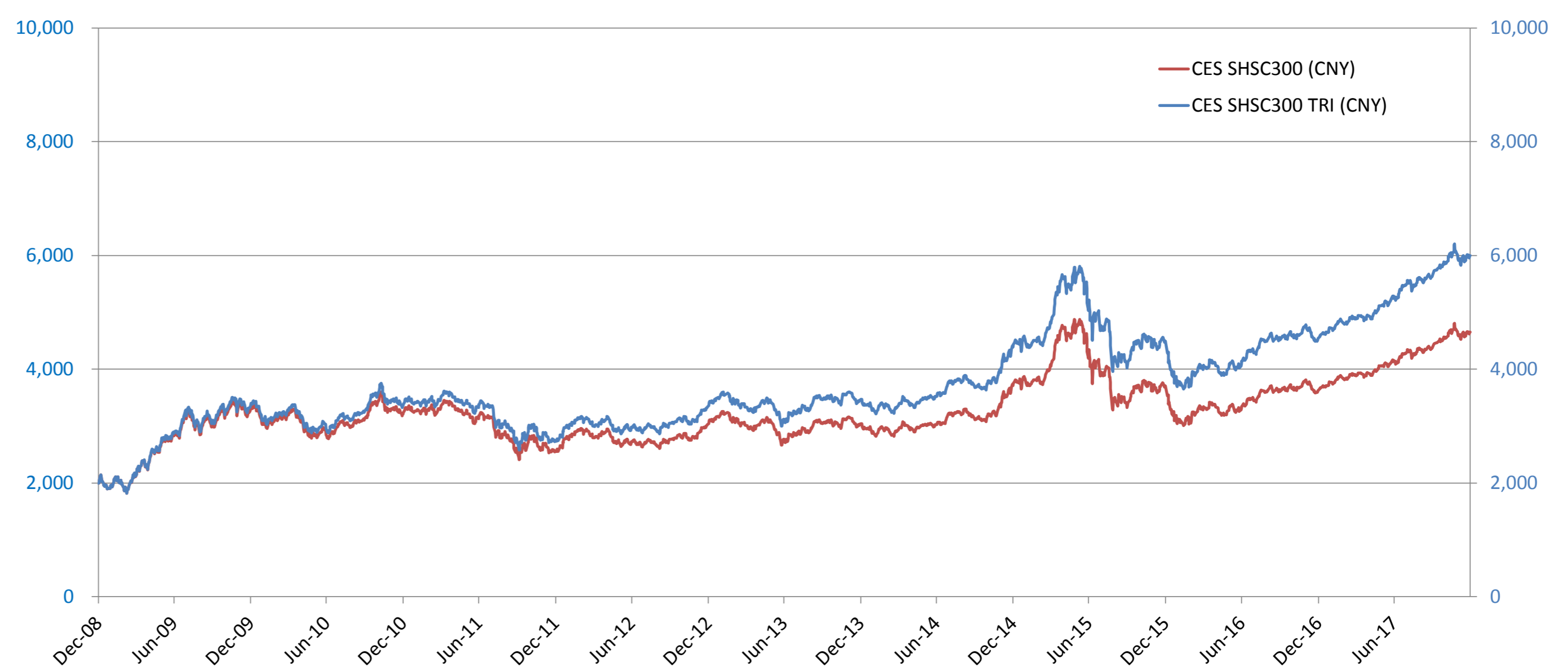
TRI-Total Return Index