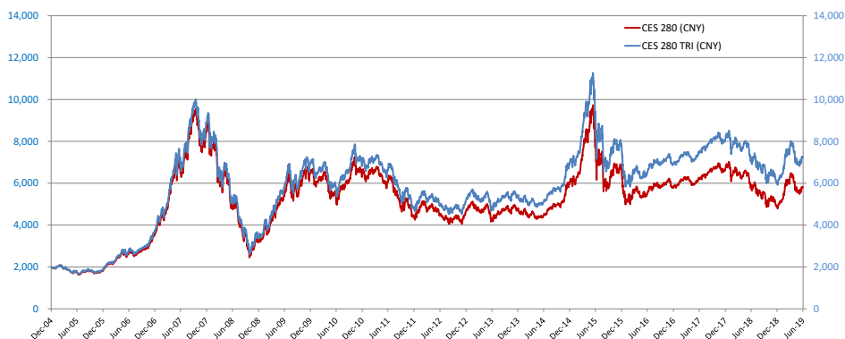
TRI-Total Return Index